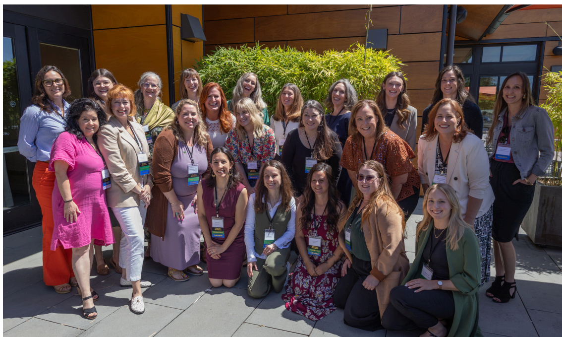
The 2025 Women in Wine Board of Directors and Committee Members